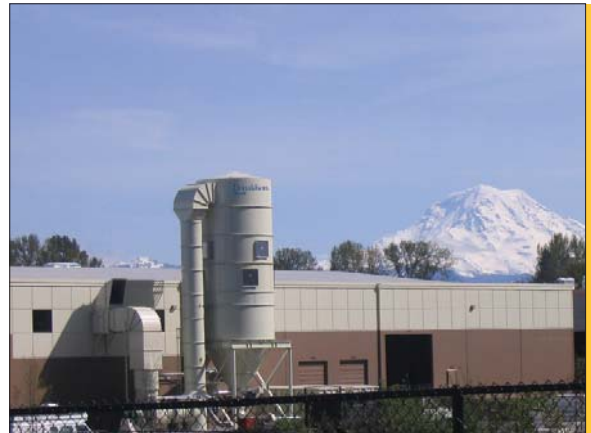
528LP12 at cabinet factory (70,000 cfm)