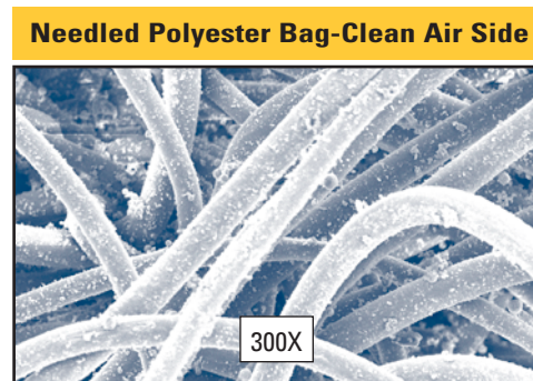
These photos were taken with a scanning electron microscope of bag media used in a collector that was filtering fly ash. The bags were removed after 2,700 hours of use. Air-to-media ratio was 4.5 to 1. Pressure drop was 6 in. on polyester bags and 2 in. on Dura-Life.

Dura-Life filter bags provide big benefits. Dura-Life technology provides better surface loading and better pulse cleaning, offering: