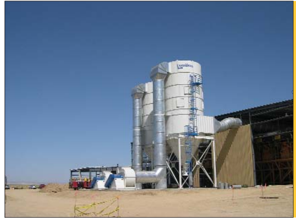
882LP12 at almond plant (140,000 cfm/each)