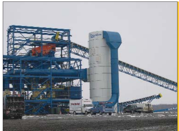
780LP12 at coal classifying plant (75,000 cfm)