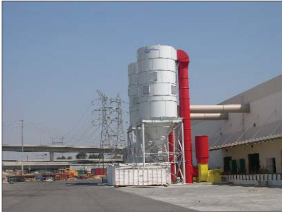
Dual 594LP12 at door plant (180,000+ cfm/combined)