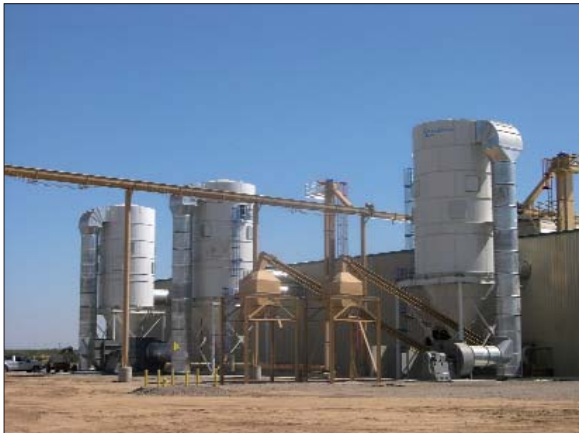
Three 684LP12 at almond shelling plant (100,000 cfm/each)