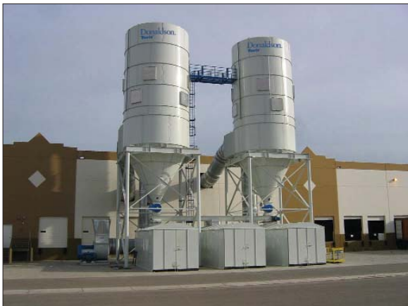
Two 594LP12 at a cabinet plant (80,000 cfm/each)